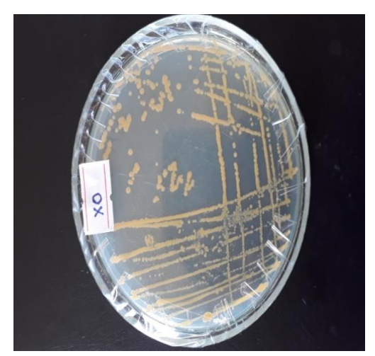
X.oryzea pv oryzea on NA