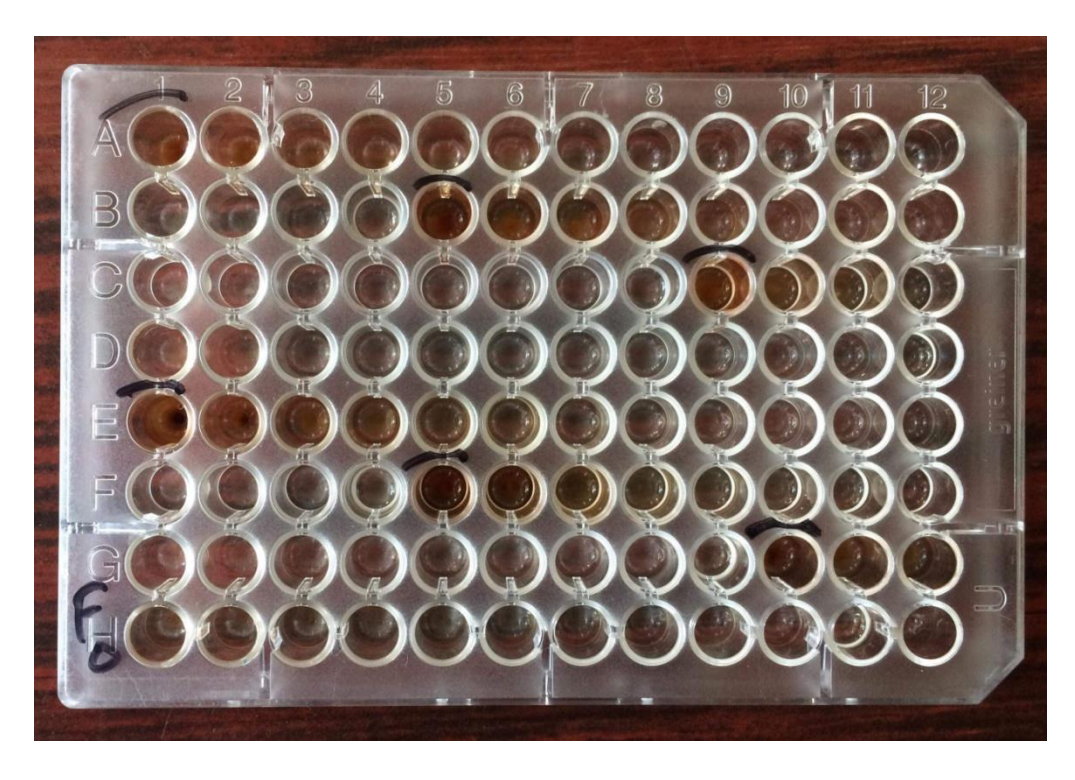
Photograph 4: Determination of MIC of aqueous extract of plant extract against fungal plant pathogens