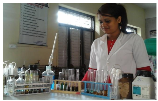
Working on lab