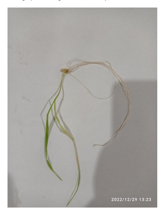
Photographs 8: Germinated plant