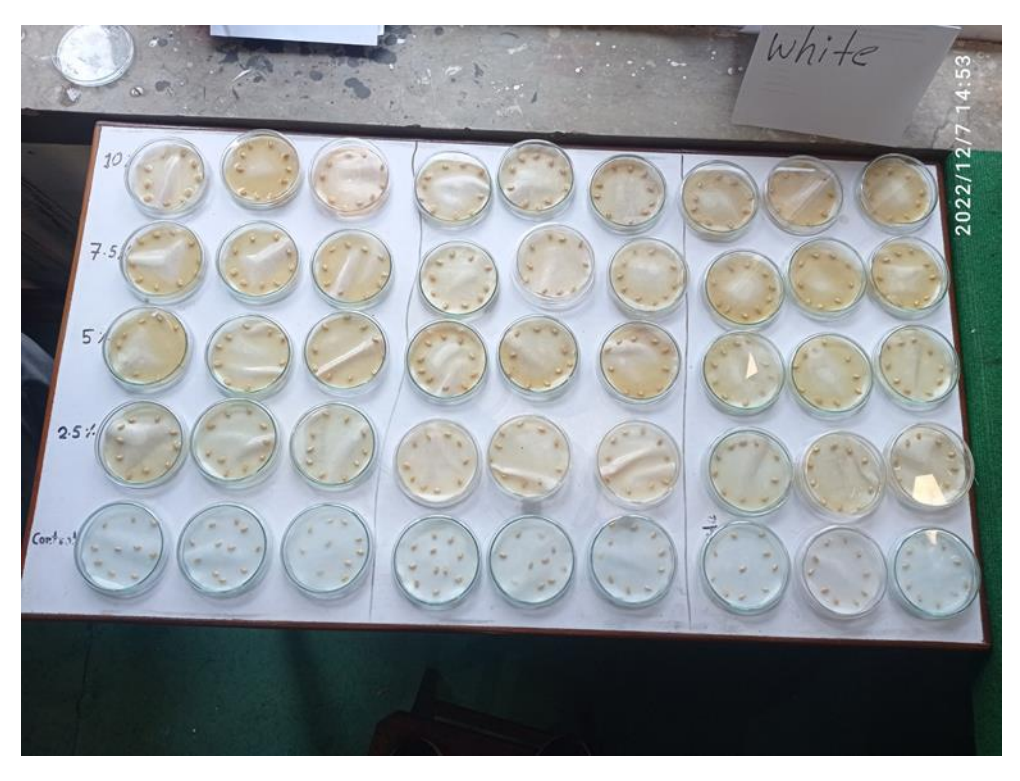
Photographs 4:Seed germination day 1