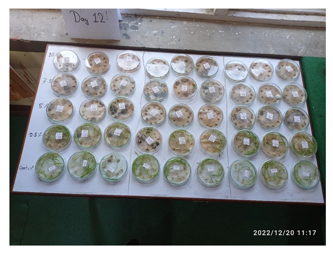
Photograph 7: Seed germination on day 12