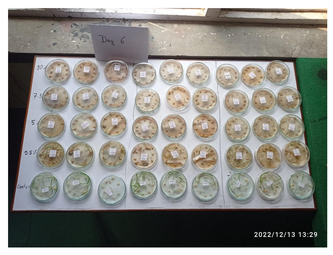
Photograph 5: Seed germination on day 6