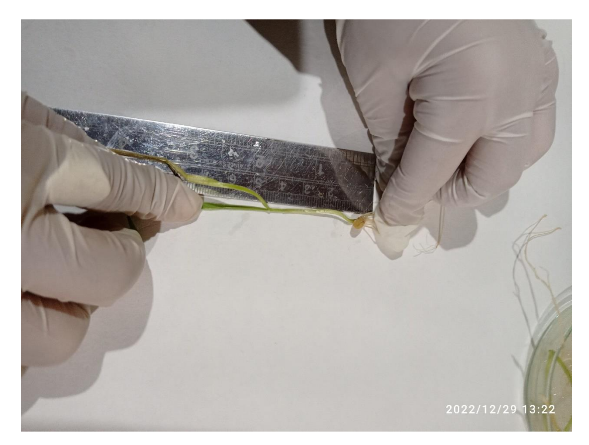
Photographs 9: Measuring germinated root and shoot