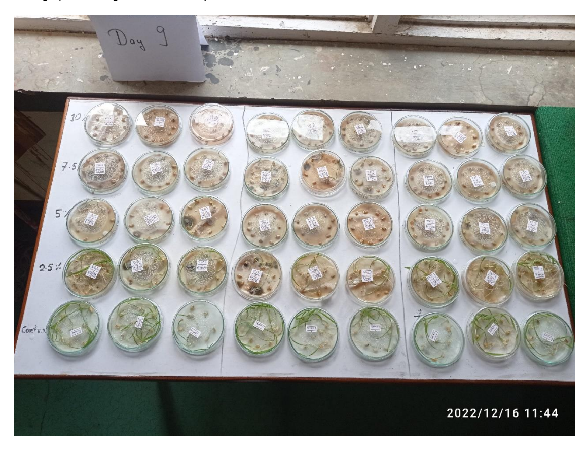
Photographs 6:Seed germination on day 9