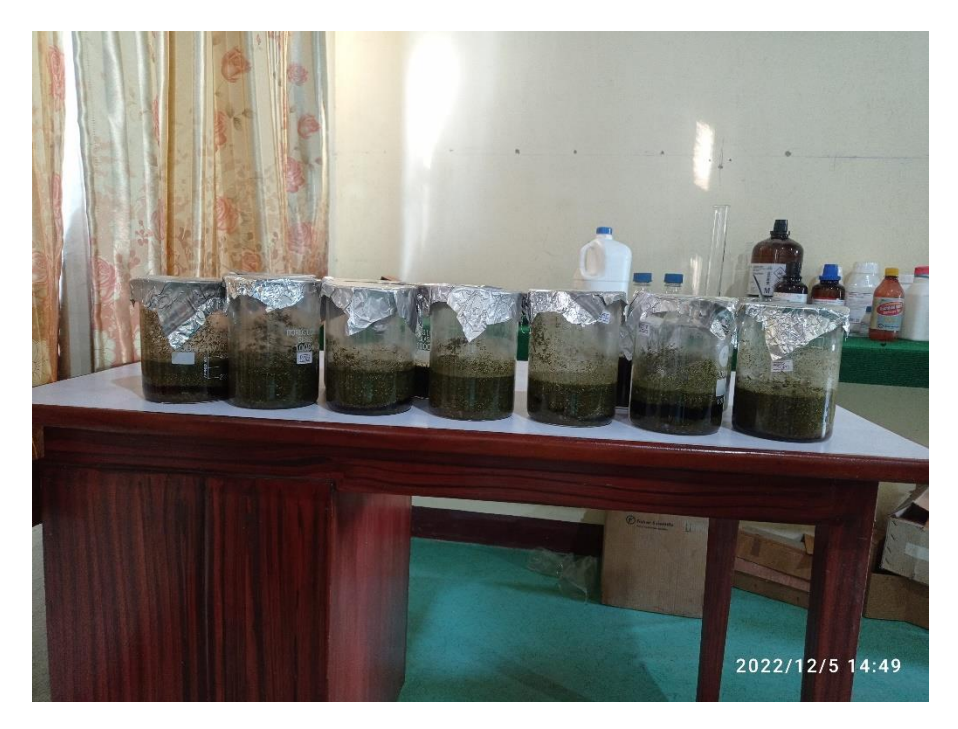
Photographs 2:Extract preparation of plant material