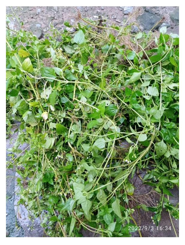
Photograph 1: Ageratum houstonianum