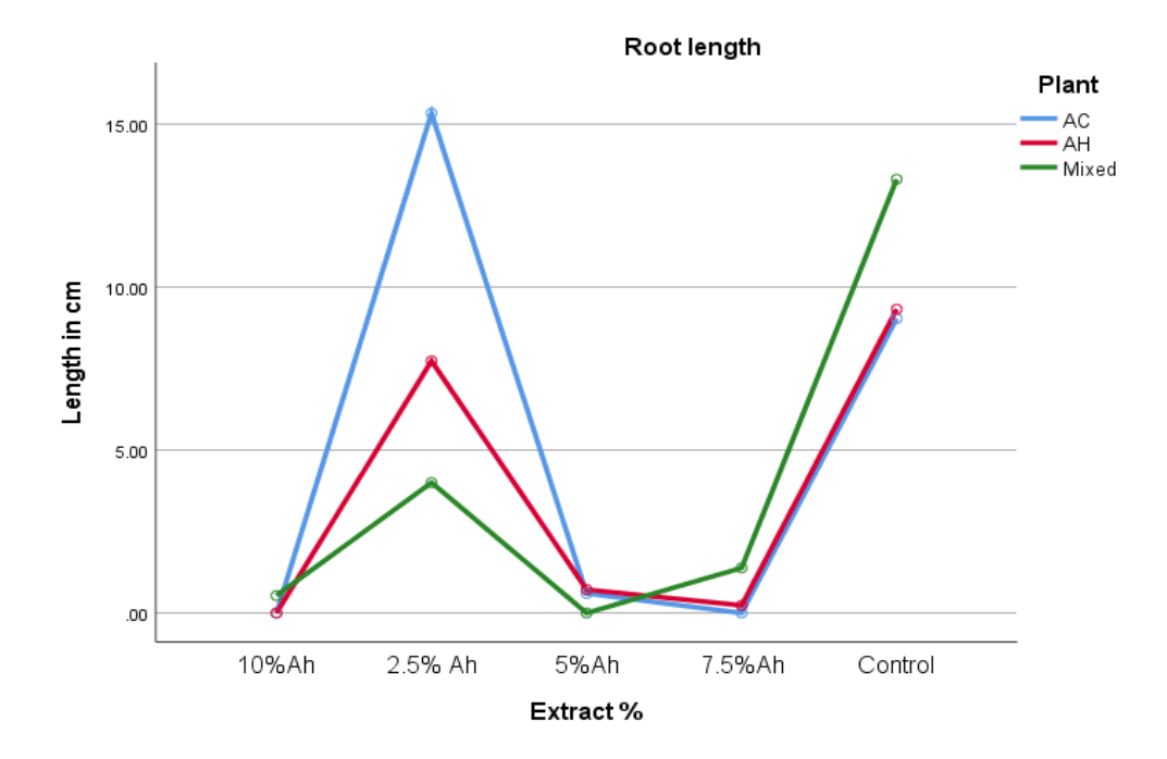
Figure 2: showing root length of Triticum aestivum

Figure 1 shows the shoot length of Triticum aestivum in different extracts was found that at 2.5% extracts of all three extracts are effective for the growth of the root as it has less allelopathic effect.